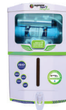
RO Water Purifier