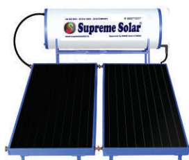
FPC Solar Water Heater