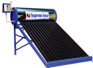
ETC Solar Water Heater